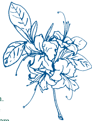
— Flame azalea

Southern Indica hybrid azaleas (Azalea x indicum) — Originating in Japan, these were the first evergreen azaleas introduced into the United States. They have an informal appearance with a loose, slightly mounding growth habit. They