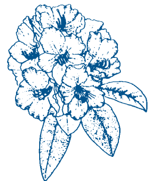
— Hybrid Rhododendron

Plumleaf azalea (Azalea prunifolium) — Blooming in July or August, this bush produces orange red to deep red flowers, and reaches 10 feet at maturity.